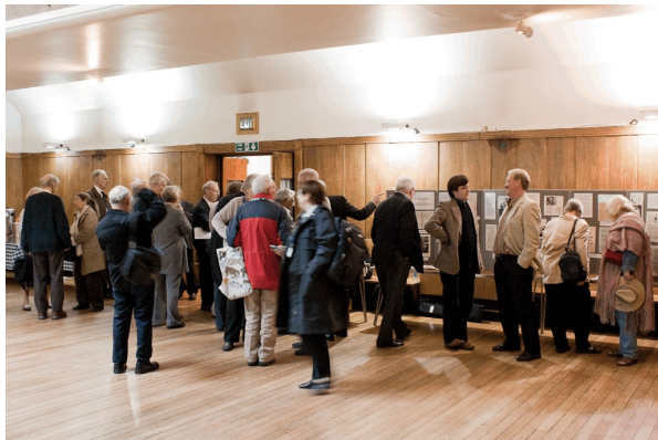
People gather before the meeting

it has caused - though, on the plus side, it has also caused widespread flouting of papal authority by Catholics in the developed world.