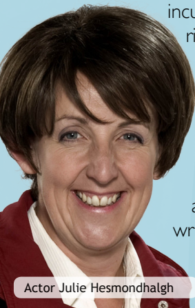
Actor Julie Hesmondhalgh