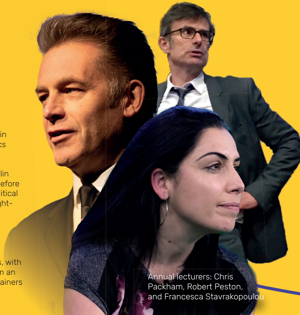
Annual lecturers: Chris Packham, Robert Peston, and Francesca Stravakopoulou

Our 2019 annual Convention in Leicester was also a huge success, with 500 people turning up to hear from an all-star cast of thinkers and entertainers over a busy weekend in June.