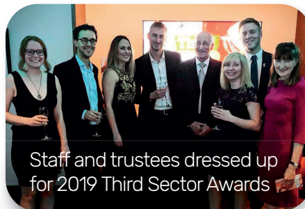
Staff and trustees dressed up for 2019 Third Sector Awards

The Non-Religious Pastoral Support Network also received a nomination for Breakthrough of the Year, reflecting the successful year we'd had, training new pastoral carers to enter hospitals and prisons around the UK and providing a vital new service.